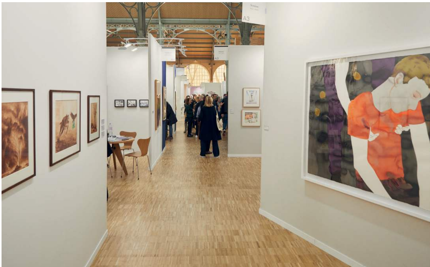
Vue de Drawing Now Art Fair 2024

The 18 th edition of Drawing Now Paris, the first contemporary art fair dedicated to drawing in Europe, will take place from March 26 to 30, 2025, at Carreau du Temple in Paris.