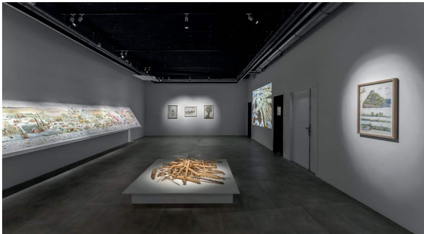
View of the exhibition Le temps profond des rivières featuring Suzanne Husky, winner of the Drawing Now Award 2023, from January 26 to April 7, 2024

Founded by Christine Phal in 2017 on a philanthropic model, the Drawing Lab is a space for experimentation and private exhibitions entirely dedicated to the promotion of contemporary drawing.