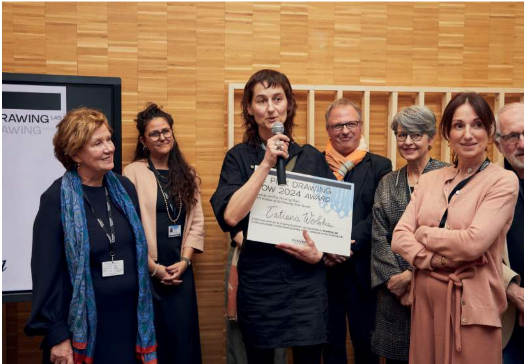
Drawing Now Award Ceremony 2024

The Drawing Now Prize has supported contemporary creation for 14 years, highlighting the pioneering role of galleries by rewarding the work of an artist presented at their booth during the Drawing Now Art Fair.